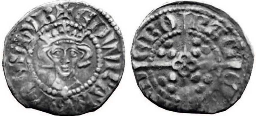
Figure 5 – Silver penny minted at York during the reign of Edward I (1272-1307). It has a quatrefoil, the symbol of the archbishop of York, on the king's chest and in the centre of the cross on the reverse. The old Latin name of York, EBORACUM, is on the reverse. SCBC 1430.