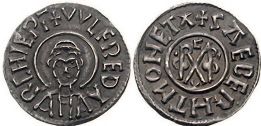
Figure 2 – Silver penny of Archbishop Wulfred (805-832) minted at Canterbury. His tonsured bust appears on the obverse surrounded by his name. The name of the moneyer, Saeberht, appears on the reverse. Like SCBC 889. (Classical Numismatic Group Auction 63, Lot 1928. cngcoins.com)

The last archbishop of Canterbury to issue coins in the Anglo-Saxon Period was Plegmund (890-914), and although the ecclesiastical mints continued to strike coins it was not till the reign of Edward I (1272-1307) that bishops' marks appear on the coins. Antony Bek (also spelt Bec and Beck) was the bishop of Durham from 1284 to 1311, and he put a cross moline (a cross with curved ends) in one angle of the cross on the reverse of the pennies minted at Durham. (Figure 3) A cross moline was Bek's coat of arms. (Figure 4) He had an interesting career, accompanying the king on crusade and being made patri-