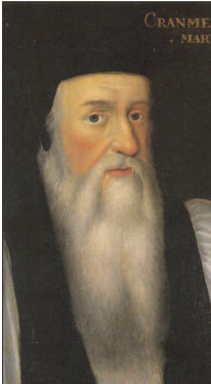
Figure 16 – Portrait of Thomas Cranmer, Archbishop of Canterbury (1532-1553).

website 'Durham Video Diaries'. Go to http://tapnortheast.co.uk/durhamblog/ and click on 'Durham Mint'.