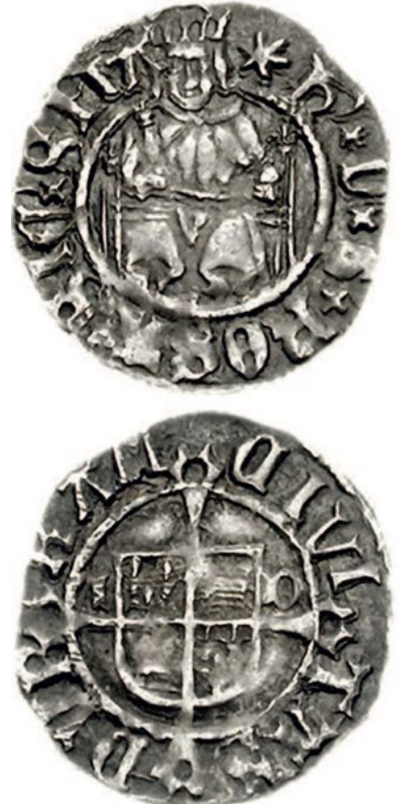
Figure 19 – Silver penny of Bishop Tunstall. Henry VIII is shown enthroned on the obverse, and the letters CD (for Cuthbert Durham) are beside the shield on the reverse. The reverse legend is CIVITAS DURHAM, Durham City. SCBC 2354. (Classical Numismatic Group Auction 72, Lot 2569)