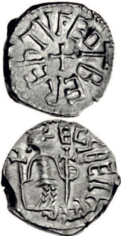
Figure 1 – Silver styca of King Eadberht and Archbishop Ecgberht (737-758) minted at York. Diameter 13 mms. The king's name surrounds a cross on the obverse. The archbishop stands holding two long crosses on the reverse, and his name is to the right. SCBC 852. (Triton XV, Lot 1843)

M OST coin collectors are not aware that from 1279 to 1534 a number of English bishops minted coins, and their marks or initials appear on the coins. This period includes the reign of Henry VIII, and is interesting for several reasons, especially for the history of the Church in England.