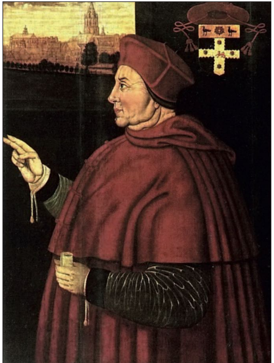
Figure 10 – Portrait of Cardinal Wolsey, Archbishop of York. (1514-1530) His cardinal's hat is shown in the upper right.

Following Warham's death in 1432 Henry VIII arranged for Thomas Cranmer to be elected archbishop of Canterbury. (Figure 16) Cranmer had been strongly influenced by Reformation ideas and supported the king in breaking away from Rome. In 1533 he annulled Henry's marriage to Catherine, and subse-