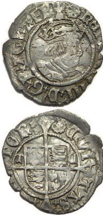
Figure 17 – Silver halfgroat of Archbishop Cranmer. There is a bust of Henry VIII on the obverse, and the letters TC (for Thomas Cranmer) beside the shield on the reverse. The reverse legend is CIVITAS CANTOR (Canterbury City). SCBC 2345.

which bear the marks and initials of such famous men as Cardinal Wolsey and Archbishop Cranmer can be collected and studied today. Anyone interested in the history of the Church in England, which is relevant to the history of the Anglican Church of Australia, should treasure these coins.