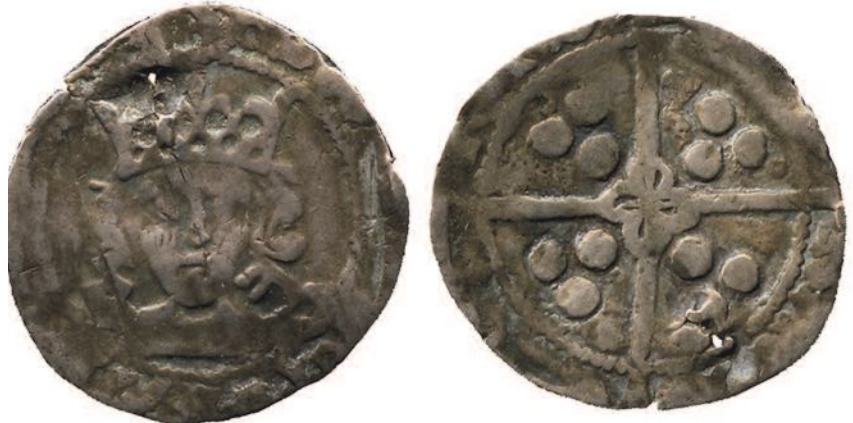
Figure 7 – Silver penny of George Neville, Archbishop of York (1465-1476). On the obverse are the bust and name of Edward IV with a key to the right of his neck and G (for George) to the left. There is a quatrefoil in the centre of the reverse. SCBC 2062.