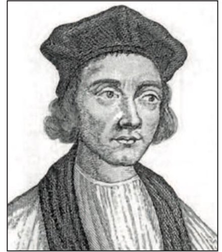
Figure 18 – Portrait of Cuthbert Tunstall, bishop of Durham (1530-1552 and 1554-1559). He is wearing a biretta, which is a stiff, square hat with four ridges on top. It is black for priests, purple for bishops and scarlet for cardinals.