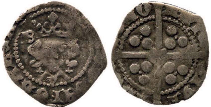
Figure 6 – Silver penny of Lawrence Booth, Bishop of Durham (1471-1476). On the obverse is the bust of Edward IV with a V on his neck, crosses above his shoulders and a large B to the left of his crown. SCBC 2120. (Baldwin's Auction 80, Lot 2220)