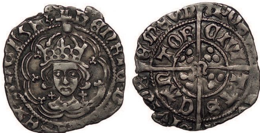
Figure 9 – Silver halfgroat of Archbishop Morton. There is a bust of Henry VII on the obverse, and M (for Morton) in the centre of the cross on the reverse. SCBC 2208.

Ecclesiastical coinage becomes particularly interesting during the reign of Henry VIII (1509-47) because in 1514 he appointed a clever and ambitious man to be archbishop of York. In 1515 he made him Lord Chancellor, and in the same year the pope made him a cardinal. His name was Thomas Wolsey. (Figure 10) Wolsey was skilful in dealing