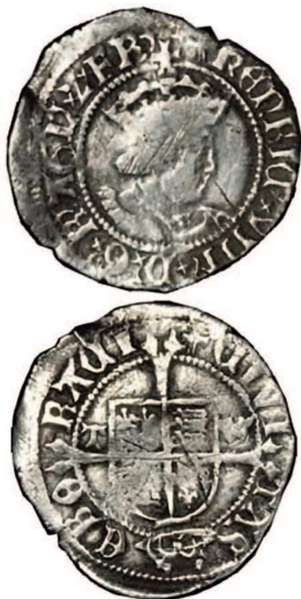
Figure 12 – Silver halfgroat of Cardinal Wolsey. It is similar to the groat in Figure 11, and Wolsey's hat is clearly shown on the reverse. The reverse legend is CIVITAS EBO-RACI, City of York. SCBC 2346.

During Henry's reign the following prelates also issued coins with their marks or initials on them: Archbishop Bainbridge of York (1508-14), Archbishop Lee of York (1531-44), Bishop Ruthall of Durham (1509-23) and Bishop Tunstall of Durham (1530-59). Bishop Tunstall (Figure 18) had a stormy career. Named 'Cuthbert' after Saint Cuthbert, whose tomb is in Durham Cathedral, he eventually agreed that Henry should be the head of the Church in England, but he was devoted to Catholicism and as England became more Protestant under Henry's son, Edward VI (1547-53) his position became untenable. In 1552 he was deprived of his bishopric. When Henry's Catholic daughter, Mary Tudor (1553-58), became queen he was re-instated, but when Henry's second daughter, Elizabeth (1558-1603), became queen, he was imprisoned in Lambeth Palace. On the coins that he minted at Durham the initials CD (for Cuthbert Durham) appear on the reverse. (Figure 19) Tunstall's mint building at Durham still stands, and there is a one-minute video about it on the