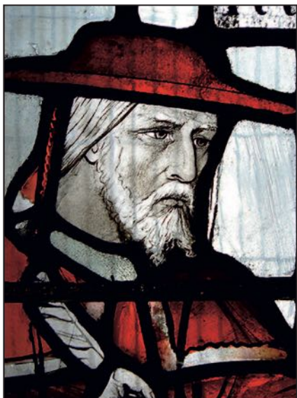
Figure 8 – Portrait of Cardinal John Morton, Archbishop of Canterbury (1486-1500).

and half-pennies minted at Canterbury. (Figure 9)