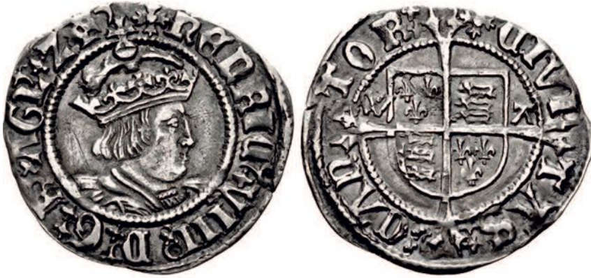
Figure 15 – Silver halfgroat of Archbishop Warham. There is a bust of Henry VIII on the obverse, and the letters WA (for Warham Archbishop) beside the shield on the reverse. SCBC 2343. (Collection of St John's Cathedral, Brisbane)