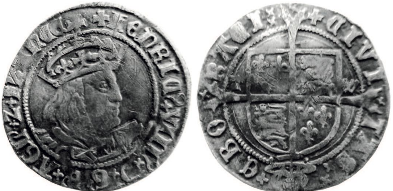
Figure 11 – Silver groat of Cardinal Wolsey, minted at York. There is a bust of Henry VIII on the obverse, and the letters TW (for Thomas Wolsey) beside the shield on the reverse. Wolsey's cardinal's hat is below the cross on the reverse. SCBC 2339. (Collection of St John's Cathedral, Brisbane)