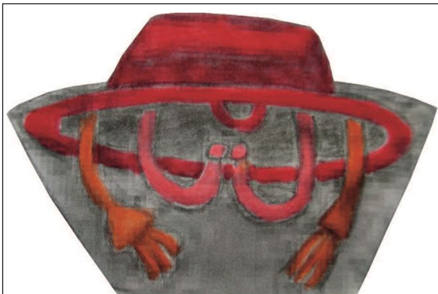
Figure 13 – Detail of reverse of Figure 12 with colour added. No hat has ever been so important in the history of a nation.