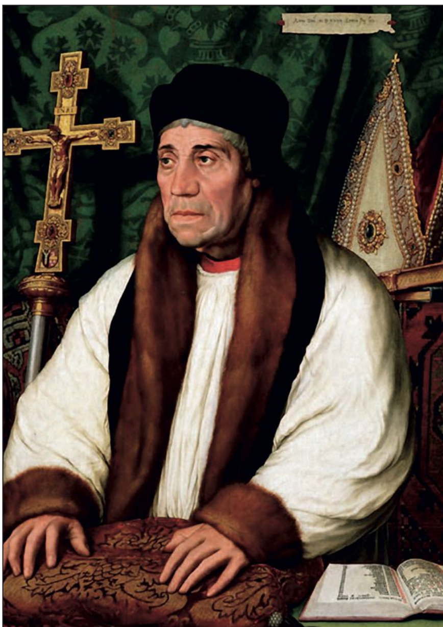
Figure 14 – Portrait of William Warham, Archbishop of Canterbury (1504-1532).