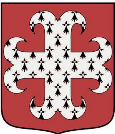
Figure 4 – The coat of arms of Bishop Bek in the form of a cross moline.