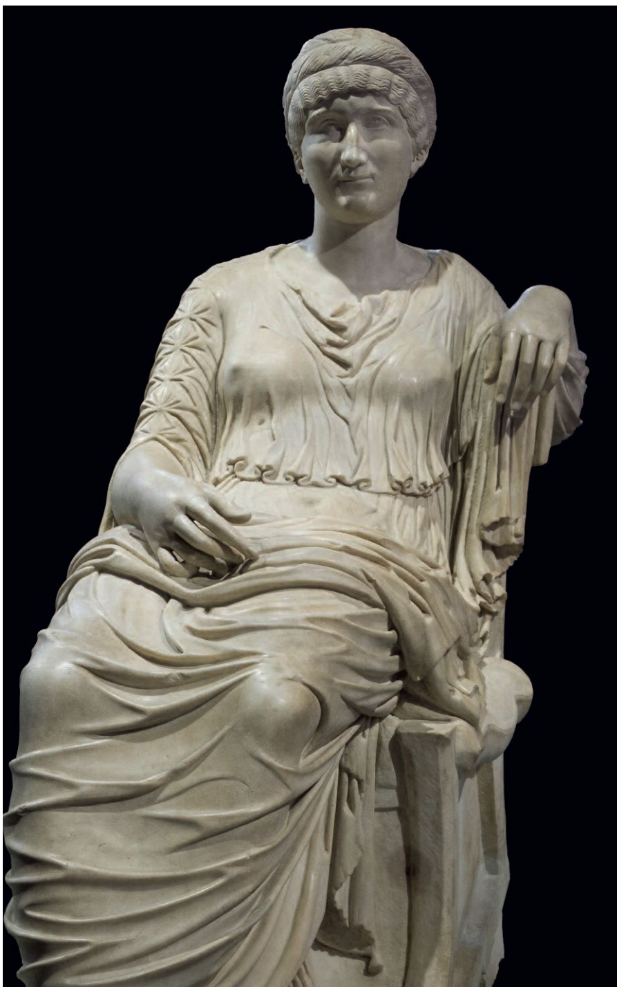
Figure 1 – Statue of Helena in the Exhibition at the Colosseum in Rome in 2013. It dates from the 2 nd half of the 2 nd century, but the head was reworked in the Constantinian period.

A mule is a hybrid animal, the result of mating a horse with an ass. It is a mismatch, and in numismatics a mule is a coin that results from mismatching the obverse and the reverse. In this case the obverse is from a coin of Helena, but the reverse is from a coin of Fausta. Helena was the mother of Constantine the Great, the first Roman emperor to be a Christian, and Fausta was his second wife.