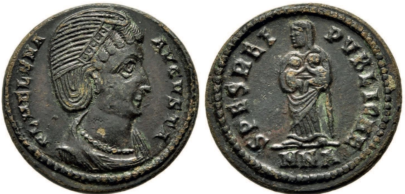
Figure 8 – Helena's mule. It is a billon centenionalis, 19 mms in diameter, weighing 3.29 grams and in uncirculated condition. The alignment is 7h. (Collection of St John's Cathedral)