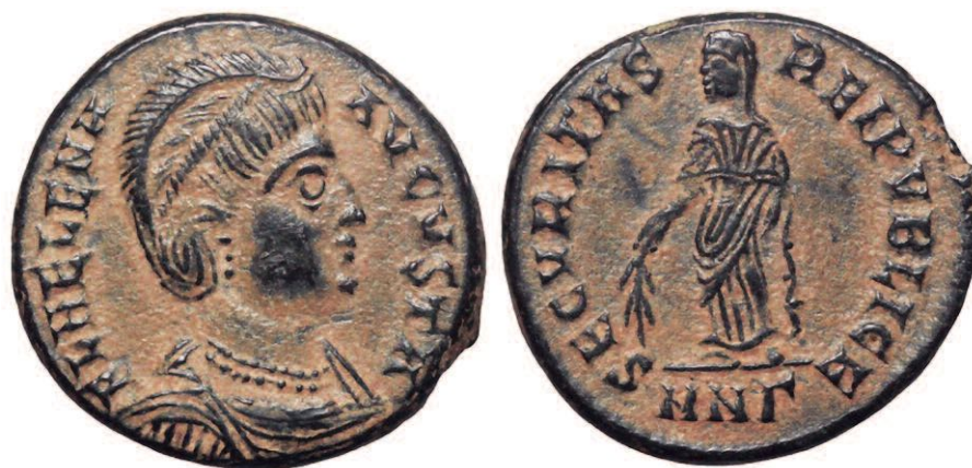
Figure 14 – Billon centenionalis of Helena minted at Nicomedia in 325-6. The mint mark is MNF. \Gamma = 3 , i.e. the 3 rd factory. On the obverse Helena's hairdo makes her look as if she is wearing a crested helmet. Sear, Vol. 4, 16620. (Roma Numismatics, Auction 6, Lot 1000)