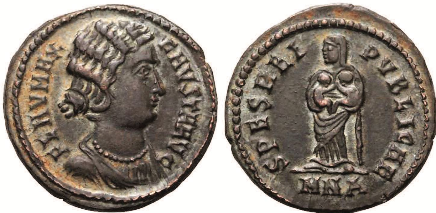
Figure 11 – Billon centenionalis of Fausta minted at Nicomedia in 325-6. On the reverse Fausta holds her two sons. The mint mark is MNA. A = 1, i.e. the 1 st factory. Sear, Vol. 4, 16575. (Roma Numismatics, Electronic Auction 5, Lot 885)