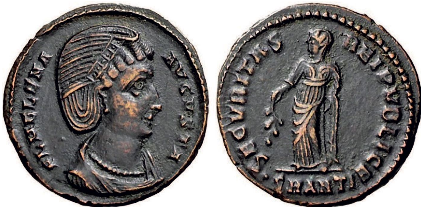
Figure 10 – Billon centenionalis of Helena minted at Antioch in 328-9. The mint mark is SMANTI preceded by a dot. I = 10, i.e. the 10 th factory. On page 672 of RIC VII it is explained why coins from the 10 th factory were the last to be minted. The last stage of development was the ladder-shaped diadem with a single pearl in each division. Sear, Vol. 4, 16628. (Gerhard Hirsch Nachfolger Auction 296, Lot 2367)

Using computer search engines it has been possible to find coins made from the same dies as Helena's mule. The identical