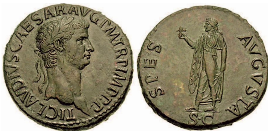
Figure 13 – Sestertius of Claudius with Spes (Hope) personified on the reverse. Sear, Vol. 1, 1854.

On the coins previously issued by Constantine in honour of Helena she is