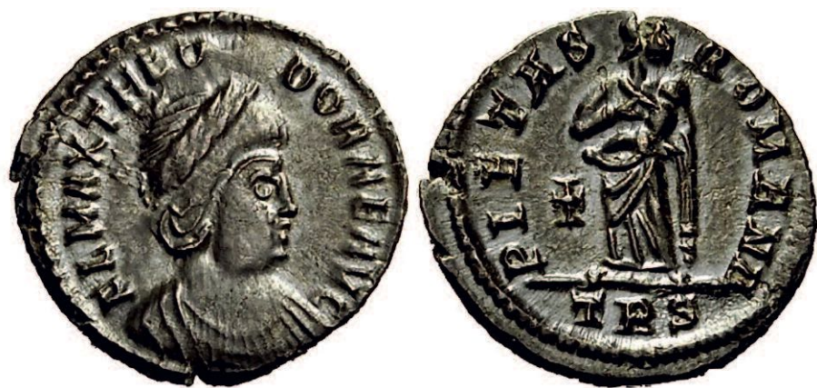
Figure 3 – Billon reduced centenionalis issued in the period 337-40 by the three sons of Fausta in honour of Theodora. Constantine died in 337. The legend on the reverse is PIETAS ROMANA (Roman Piety). The mint is Trier. Sear, Vol. 5, 17499. (Auktionen Meister & Sonntag, Auction 12, Lot 197)