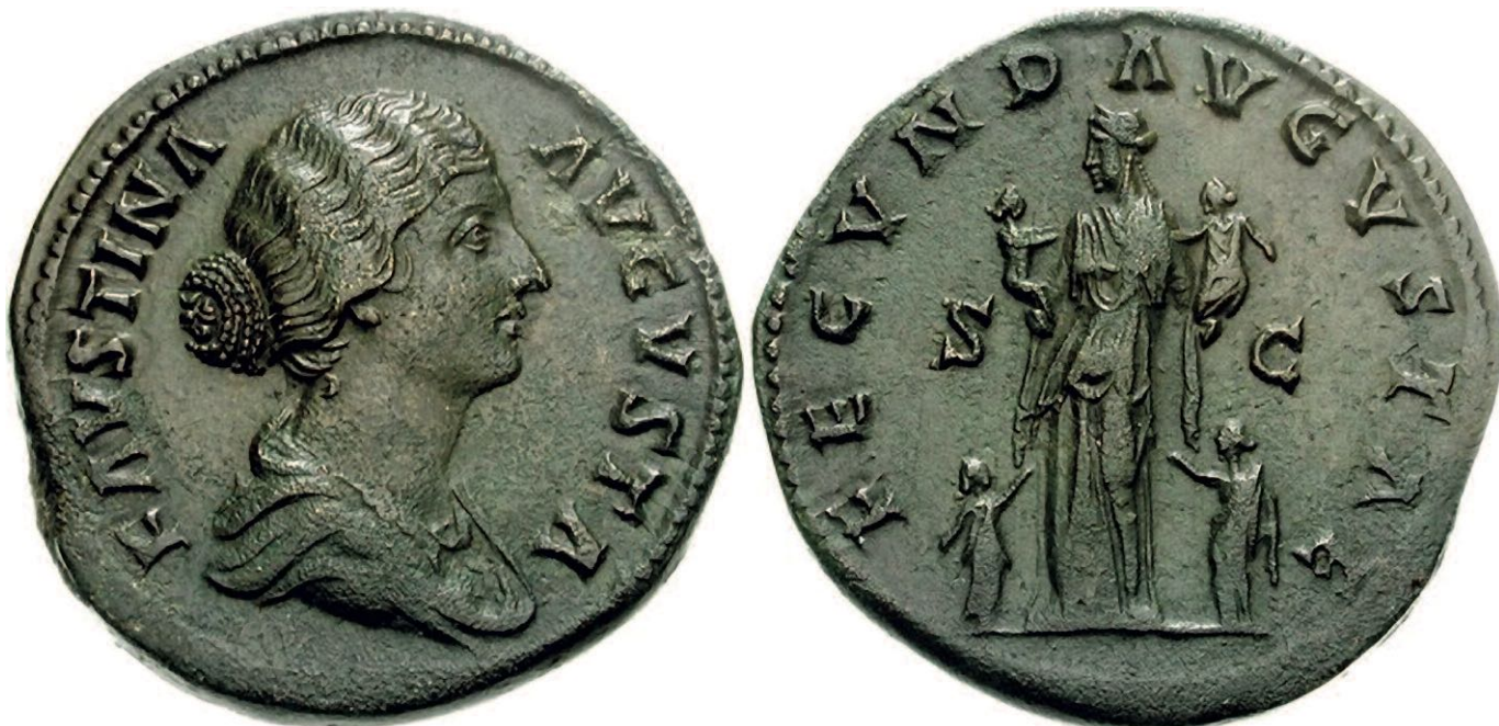
Figure 12 – Sestertius of Marcus Aurelius with Faustina on the obverse. On the reverse she holds two of her children. FECVND AVGVSTAE means 'the fertility of the empress'. Sear, Vol. 2, 5273.

image of Helena occurs on a coin minted at the 10 th factory in Antioch during the period 327-8. (Figure 10) Notice in the left field the pellet which is a tiny flaw in the die. The identical image of Fausta standing and holding her sons, Constantine II and Constantius II, occurs on a coin minted at the 1 st factory in