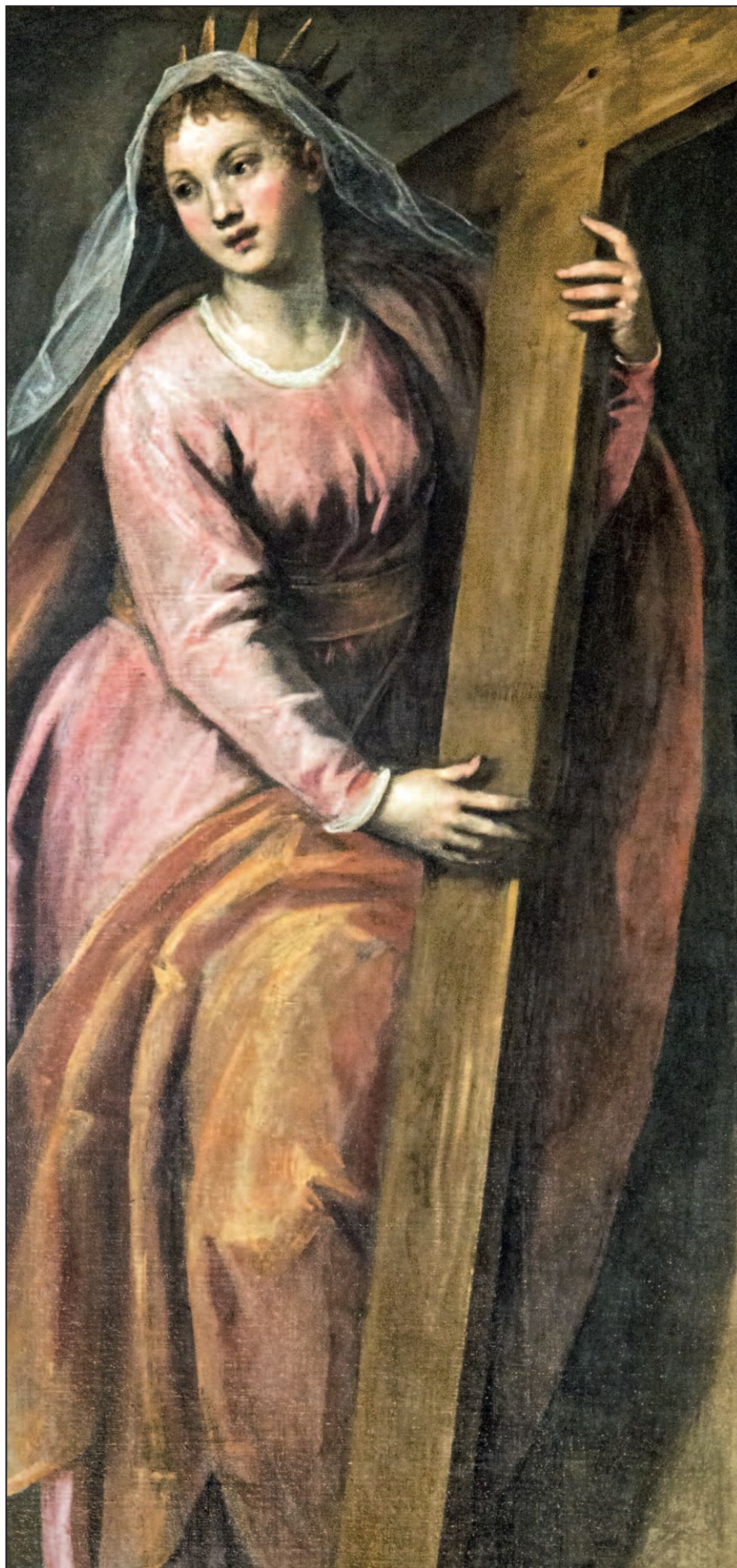
Figure 15 – Saint Helena holds the cross on which Jesus was crucified. According to some late 4 th century sources she found the True Cross when she visited Jerusalem. (Painting, oil on canvas, by Palma il Giovani, c. 1593 in Venice.)

Find out more: visit the SCDA website: www.scdaa.com.au