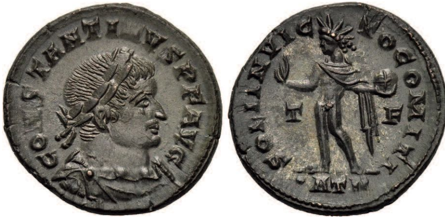
Figure 6 – Billon follis of Constantine minted at Trier in 317. It shows Sol on the reverse with the legend SOLI INVICTO COMITI. Sear, Vol. 4, 16063. (Numismatik Naumann Auction 9, Lot 769)

To distance herself from these tragic events Helena went on an extended tour of Palestine, probably during the years