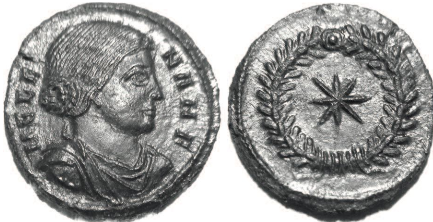
Figure 7 – Billon centenionalis issued in honour of Helena in 318. On the obverse N F after HELENA stands for Nobilissima Femina (most noble woman). On the reverse the star in a wreath suggests a connection with Sol Invictus (the unconquered sun) who is Constantine's comrade. There is a sun-symbol at the top, and the star probably represents Constantine as Saturn, the highest of the seven levels of Mithraism. Sear, Vol. 4, Lot 16583. (Collection of St John's Cathedral)