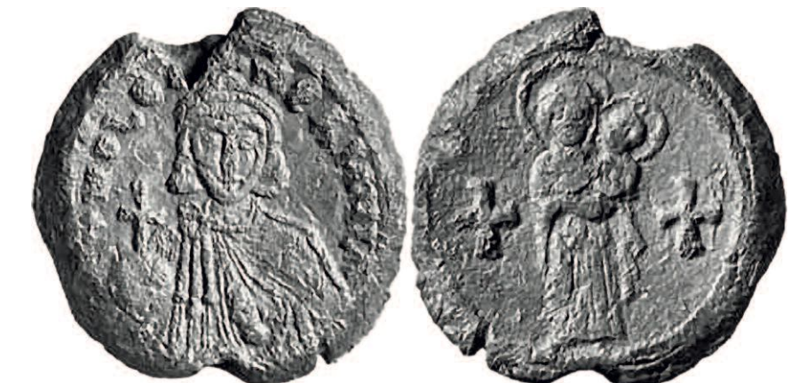
Figure 4 – Seal of the Byzantine emperor Leo III (716-741). It is 35 mms in diameter. On the reverse Mary holds the Christ Child. Zacos 33. (Gorny & Mosch Auction 122, Lot 2397)