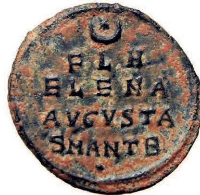
Figure 5 – Billon follis issued in honour of Helena as Augusta at Antioch in 324. Sear, Vol. 4, 18659. (Collection of St John’s Cathedral)