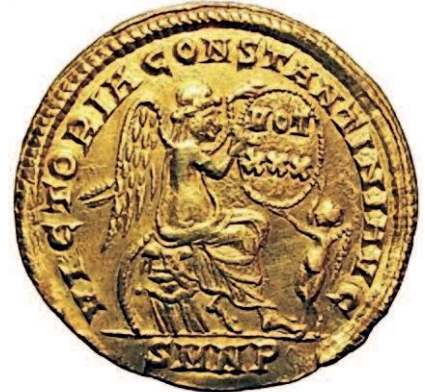
Figure 9 – Solidus of Constantine I minted at Nicomedia in 335. On the reverse Victory inscribes VOT XXX on a shield held by a small winged figure. The legend means 'The Victory of the Augustus Constantine'. Sear, Vol. 4, 16759. (Collection of St John's Cathedral)