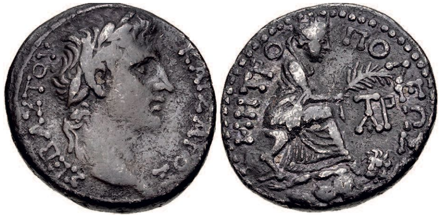
Figure 3 – Tetradrachm of Augustus. Diameter 25 mms. The inscription on the reverse means “of the metropolis”. There is a monogram of TAP for Tarsus in the right field.