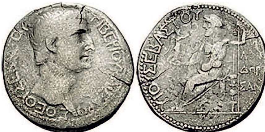
Figure 9 – Tetradrachm of Tiberius probably minted at Tarsus. On the reverse there are magistrates' names behind Zeus. (Collection of St John's Cathedral, Brisbane)

became a major mint, and tridrachms with a variety of reverses were issued. The local god, Sandan, reappears on some of Hadrian's coins. (Figure 12) From Hadrian to Gallienus (253-268 AD) Tarsus regularly issued bronze and occasionally silver coins. The reverse types mostly reflect Greco-Roman mythology and religion. Heracles (known as Hercules to the Romans) was a popular superhero and he appears frequently on the coins performing one of his Twelve Labours. Presumably he reflected the valour of the emperor and his military forces.