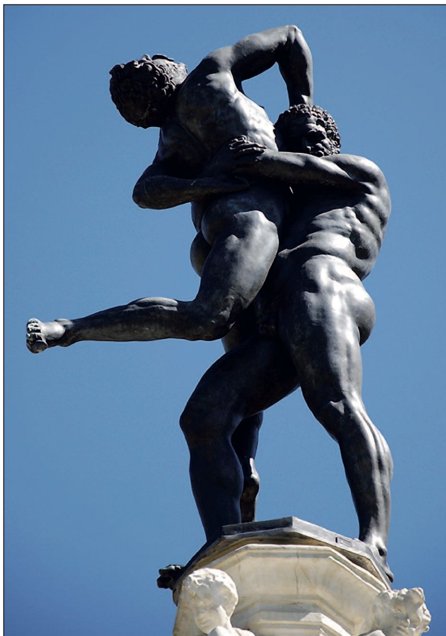
Figure 16 – Statue of Hercules and Antaeus on the fountain at the Medici Villa of Castello, Florence, 16th century.

wine and revelry, on the reverse. On the first (Figure 20) Dionysus is probably DRUNK because he holds a cantharus (a large wine cup) but he stands with his