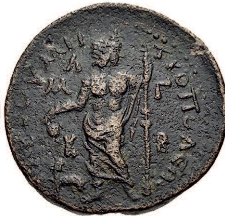
Figure 20 – Bronze coin with Herennia Etruscilla on the obverse. Diameter 28 mms. On the reverse Dionysus stands with his garment around his waist. (Classical Numismatic Group, Electronic Auction 266, Lot 271)