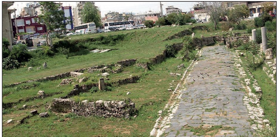
Figure 5 – Roman road excavated in the centre of Tarsus.