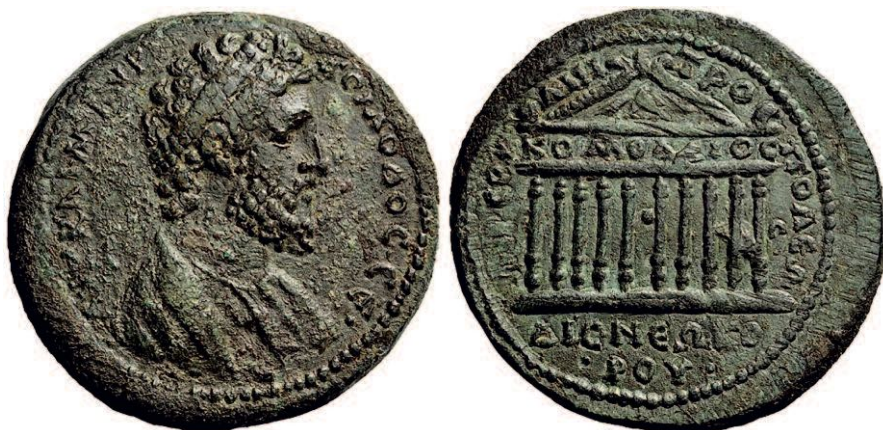
Figure 17 – Bronze coin of Commodus (177-192 AD). Diameter 34 mms. Below the temple the Greek words mean "Twice temple-guardians (of the imperial cult)" and the word "Commodeian" on the temple suggests that Commodus actually visited the city. (Nomos Auction 6, Lot 157).