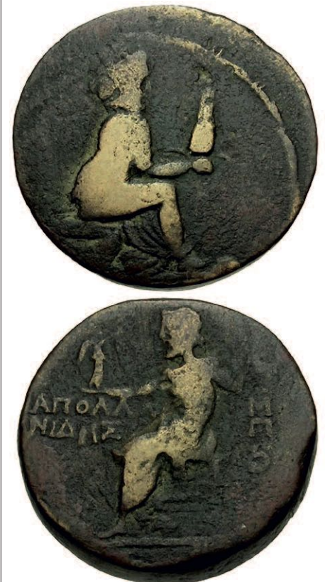
Figure 10 – Very worn bronze coin of Tarsus. Diameter 27 mms. Tyche holds a large ear of grain. Zeus holds Nike and below is the name of the magistrate ΑΠΟΛΛΩΝΙΔΗΣ (Apollonides). Paul would have known of him. Behind Zeus is ΤΑΡΣΕΩΝ (of the Tarsians).

On a coin of Caracalla (198-217 AD) Heracles is fighting Antaeus (Greek: Antaios) who was the son of Poseidon (god of the sea) and Gaia (Earth). This incident occurred during his Eleventh Labour when he was sent by Eurystheus, the king of Tiryns in Greece, to fetch the golden apples of the Hesperides who were the daughters of Atlas. The apples grew on a tree that was guarded by a serpent. After killing the serpent and getting the apples (Figure 13) Heracles was returning to Greece when he was challenged by Antaeus. He was a belligerent fellow who liked to wrestle with men and kill them. He always won because whenever his body came in contact with the earth his strength was restored. When they began to wrestle, Heracles wondered why Antaeus would throw