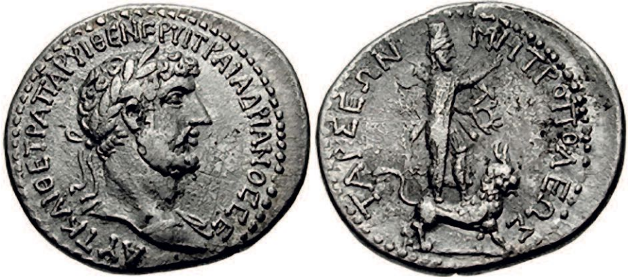
Figure 12 – Tridrachm of Hadrian. Diameter 25 mms. Sandan stands on a mythical beast (a lion with horns and wings) and holds a garland and a double-headed axe in his left hand. (Classical Numismatic Group, Mail Bid Sale 64, Lot 689)