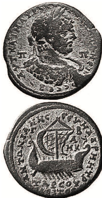
Figure 18 – Bronze coin of Caracalla (198-217 AD). Diameter 33 mms. The galley is carrying wheat to Tarsus. The rudder is clearly shown at the stern of the ship, and the shape of the sail indicates that it is going backwards!