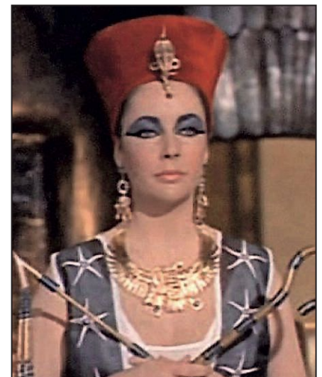
Figure 2 – Elizabeth Taylor played the role of Cleopatra in the movie.