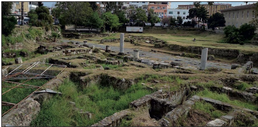
Figure 6 – Roman houses excavated in the centre of Tarsus.