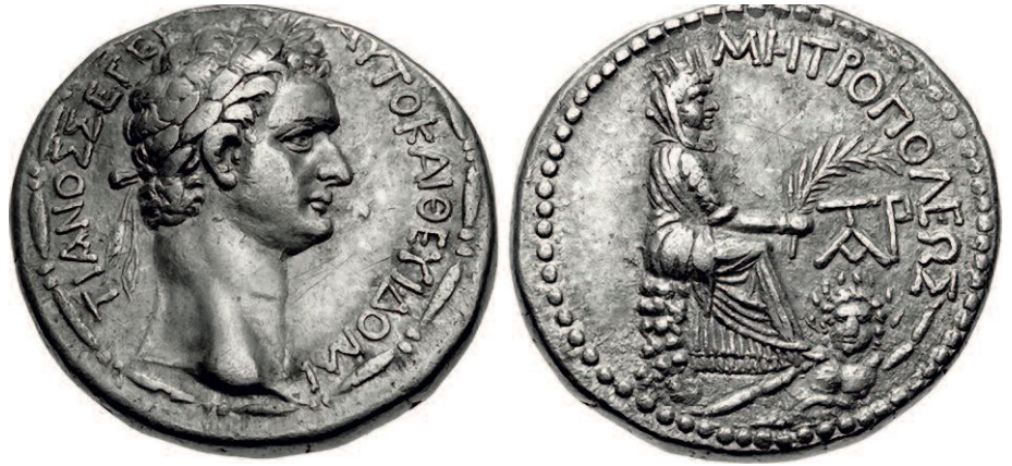
Figure 11 – Tetradrachm of Domitian. Diameter 26 mms.

The whole of Cilicia prospered during the Roman period and Tarsus had to compete with the other cities in the province such as Adana and Anazarbus. On the coins of Tarsus the word ΜΗΤΡΟΠΟΛΙΣ (metropolis = mother city) usually appears, often with the letters AMK, which stand for Greek words