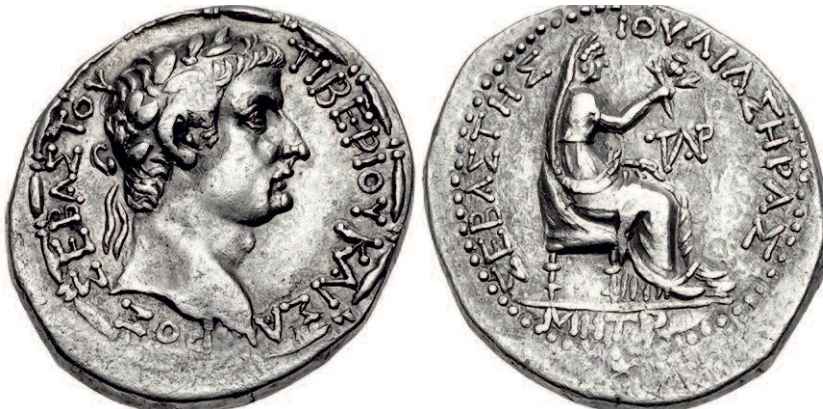
Figure 7 – Tetradrachm of Tiberius. Diameter 27 mms. As the goddess Hera, Livia (Julia) holds two ears of grain and a poppy head. The inscription means "of the Augusta Julia Hera."