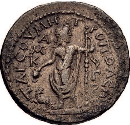
Figure 21 – Bronze coin with Herennia Etruscilla on the obverse. Diameter 28 mms. On the reverse Dionysus stands with his genitals exposed.