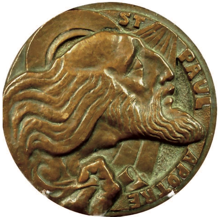
Figure 4 – Bronze medal of the Mint of Paris with an image of St Paul probably by Annette Landy and struck in 1960. Diameter 59 mms. (Author's Collection)