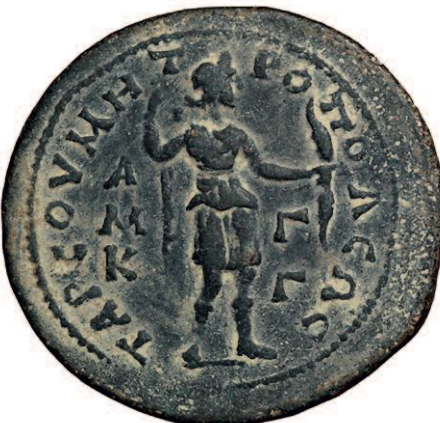
Figure 23 – Bronze coin of Gallienus (253-268 AD). Diameter 32 mms. Artemis the huntress is pulling an arrow out of a quiver on her back. (Roma Numismatics, May 2013 Auction, Lot 1043)