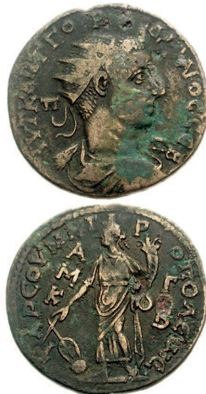
Figure 19 – Bronze coin of Gordian III (238-244 AD). Diameter 36 mms. Tyche, the city goddess, holds a cornucopia and a rudder on a globe. The letters AMK are prominent.