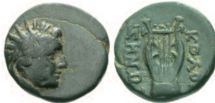
Figure 2 – Bronze coin of Colossae with the radiate head of Apollo/Helios on the obverse and a lyre on the reverse. 14 mms diam. ?unpublished.

onina on the obverse (Sear, Roman Coins , Vol. III, 10633) and the other was a so-called anonymous follis minted at Constantinople in about 1045 AD (Sear, Byzantine Coins , 1825). This meagre