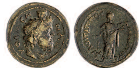
Figure 7 – Bronze coin from the time of Antoninus Pius with the bust of Sarapis on the obverse and Hygea standing and feeding a snake from a patera on the reverse. 20 mms diam. BMC 2.

Colossae is in the valley of the Lycus River about 200 kms east of Ephesus (Figure 3 – map). Today it is just a large mound (Figure 4) but in the 5 th century BC Herodotus in his Histories (Book 7, Section 30) described Colossae as ‘a Phrygian city of great size’. In the first century BC Strabo in his Geography (12.8.13) called it a ‘polisma’, which was translated as ‘a small city’, but recently scholars think the word just means ‘a city’. The fact that no coins were issued by Colossae in the first century AD suggested that it was a small city of no importance and that the neighbouring cities of Laodicea and Hierapolis had drained the