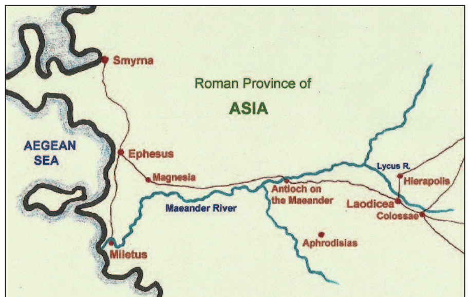
Figure 3 – Map of the Maeander and Lycus Rivers.

On the obverse of one of these early coins there is the laureate head of Zeus with his symbol, a thunderbolt, on the