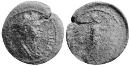
Figure 5 – Bronze coin of Hadrian with the bust of Sabina on the obverse and Artemis on the reverse. 20 mms diam. Von Aulock, Phryg. II , 549. (Source: Lindgren III, Ancient Greek Bronze Coins from the Lindgren Collection , by H.C. Lindgren, 574)