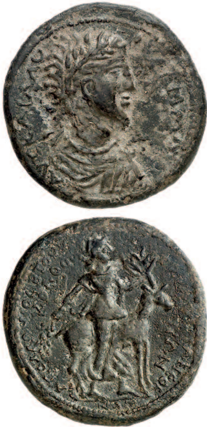
Figure 11 – Bronze coin with the bust of Commodus on the obverse and Artemis holding the antler of a stag on the reverse. 35 mms diam. Von Aulock, Phryg. II, 575. (Collection of St John's Cathedral, Brisbane. Image used with permission.)

similar coin (Figure 8) with Demos (the people) on the obverse has been allocated to the time of Commodus as Caesar (175-177 AD). No doubt these coins were issued to promote the cult of Artemis by identifying the Artemis worshipped at Colossae with the Artemis worshipped at Ephesus in the great temple which was one of the seven wonders of the ancient world.