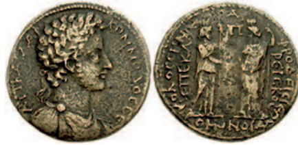
Figure 12 – Bronze coin of Commodus with his bust on the obverse and the Tyches of Colossae and Aphrodisias holding hands on the reverse. 34 mms diam.

similar coin (Figure 8) with Demos (the people) on the obverse has been allocated to the time of Commodus as Caesar (175-177 AD). No doubt these coins were issued to promote the cult of Artemis by identifying the Artemis worshipped at Colossae with the Artemis worshipped at Ephesus in the great temple which was one of the seven wonders of the ancient world.