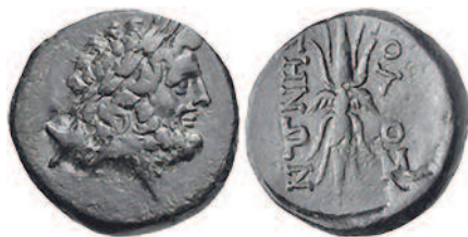
Figure 1 – Bronze coin of Colossae with the head of Zeus on the obverse and a winged thunderbolt on the reverse. 20 mms diam. Sear 5131.

As a general principle, if a city issued a coin featuring a particular god or goddess that deity would have been worshipped in the city and there would have been a temple or shrine to that deity in the city. On the coins of Colossae several deities are shown, and the archaeologists will be expecting to find evidence of their cults when they begin excavating the site. Most of the coins that the archaeologists will find, however, will be coins that were not minted in the city but circulated widely in the region. In fact, of the two coins found so far just lying on the surface one was a billon antoninianus minted at Rome in 265-7 AD with the bust of Sal-