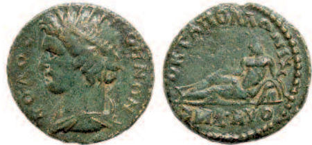
Figure 6 – Bronze coin from the time of Hadrian with the radiate head of Apollo/Helios on the obverse and a recumbent river-god on the reverse. 16 mms diam. Von Aulock, Phryg. II , 452.

reverse (Figure 1). On the obverse of the other coin there is the radiate head of a god (Figure 2) and such an image would previously have been recognized as that of Helios, the sun god, but by this time Helios was being identified with Apollo, the god of light. That the god on the coin is Apollo/Helios is suggested by the lyre, the symbol of Apollo, on the reverse. Originally in Greek mythology Apollo was different from Helios but as this coin suggests he was later identified with him.