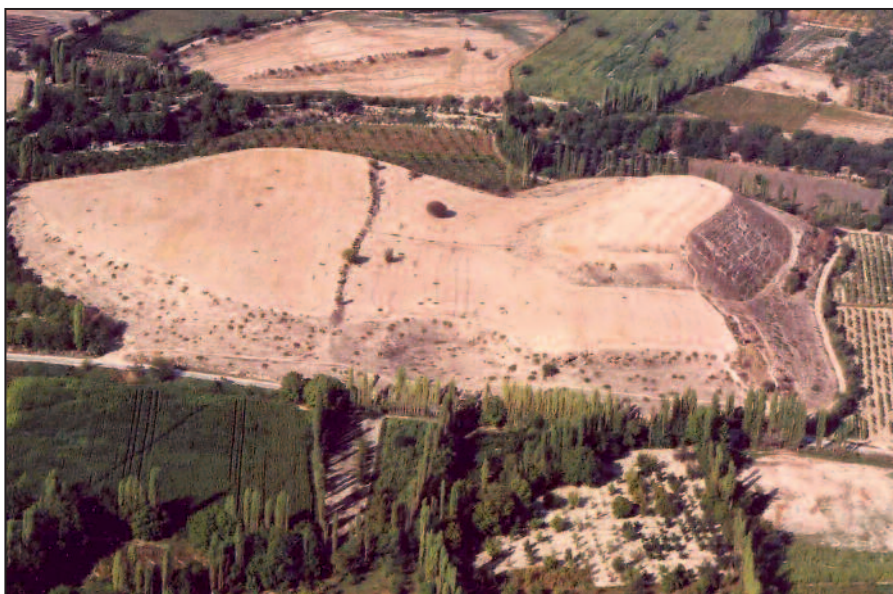
Figure 14- Aerial view of the mound of Colossae.

PO Box 523 NARRABEEN NSW 2101 Phone (02) 9913 3036