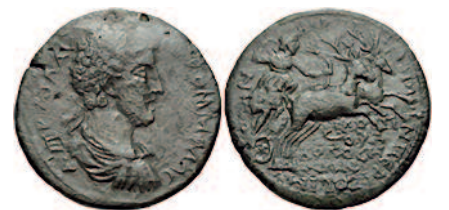
Figure 10 – Bronze coin with the bust of Commodus on the obverse and Artemis driving a biga of stags on the reverse. 35 mms diam. BMC 14.

The bust of L. Aelius Caesar (136-138 AD) occurs on the obverse of a coin with the cult statue of Artemis of Ephesus between two stags on the reverse. A