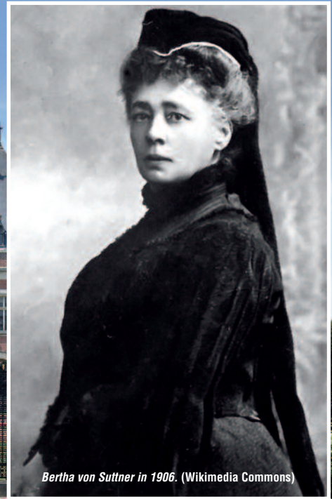
Bertha von Suttner in 1906.