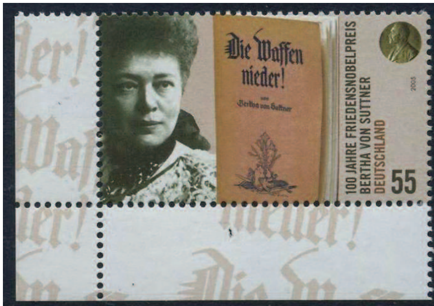
A German stamp celebrating 100 years since Bertha von Suttner's Nobel Peace Prize. In the middle is an image of her book, and in the top right, an image of Alfred Nobel.