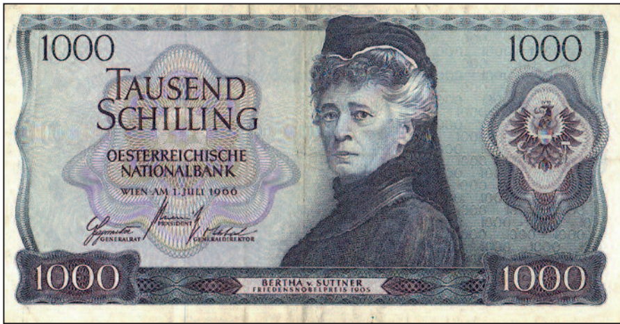
Austrian banknote issued in 1966 showing Bertha von Suttner.

his steel company to J. Pierpont Morgan for $250,000,000 and devoted himself to philanthropy. One of his charitable foundations was the Carnegie Endowment for International Peace, founded in 1910; and in 1911 Bertha became a member of the advisory council. He also endowed the impressive Peace Palace in The Hague, which was completed in 1913. The International Court of Justice, which is the primary judicial branch of the United Nations, is based in the Peace Palace. On 31 st March this year the court found that Japan's whaling program in the Antarctic was not in accordance with the International Convention.