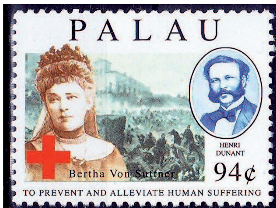
Stamp of Palau issued in 2005 showing Bertha von Suttner and Henry Dunant.

So Bertha went to Paris to work for Alfred Nobel. He was very impressed with this beautiful, intelligent woman; but she stayed in Paris for only about a week because she received a telegram from Arthur saying, "I cannot live without you." Bertha also realized that she could not live without Arthur, and she returned to Vienna. She and Alfred wrote letters to each other until he died in 1896. Bertha and Arthur married secretly and moved to the Caucasus region in Russia, where for nine years he eked out a living teaching German and giving riding lessons. She began to write articles and novels in which she criticized the social conditions in Europe.