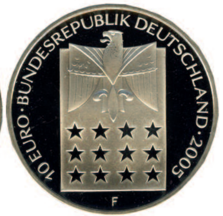
Bertha von Suttner on a 10-euro coin issued in 2005 to celebrate 100 years since her Nobel Peace Prize.