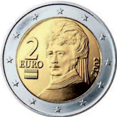
Bertha von Suttner on a 2-euro coin issued in 2002. The 2014 coin is similar except for the date.

present interest in commemorating World War I, which started for Britain and Australia on 4 th August 1914, only six weeks after Bertha's death. The German government ignored the ultimatum of the British government that all German troops be withdrawn from Belgium by 11 p.m. on 4 th August, and so the terrible "war to end all wars" began.